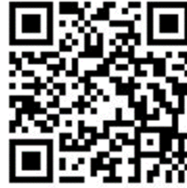
▲ Official Website