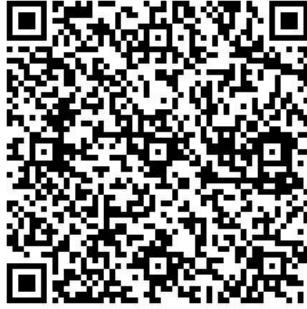
▲ Facebook page of the Changhua Branch