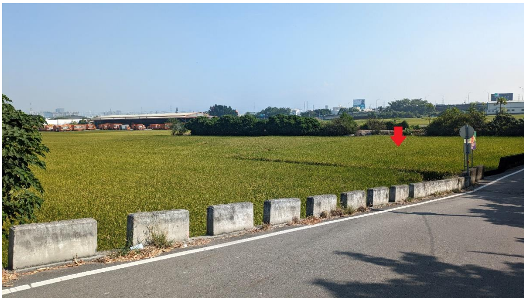
▲ Current condition of Lot No. 874, Xiangshan Section