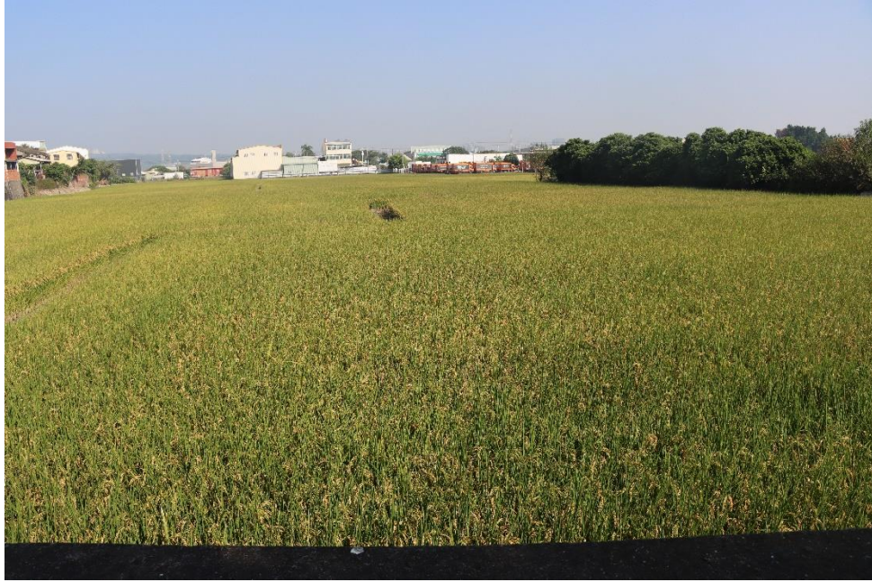
▲ Current condition of Lot No. 874, Xiangshan Section